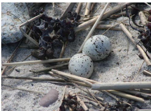
The eggs of terns and plovers are difficult to spot as they blend into the sandy beach areas that are used by visitors

Islands such as Sandy Point provide very important habitat for wildlife, especially migratory birds. Species such as the least tern, roseate tern, and the piping plover use the Island to nest, rear young, feed, and stage during migration. Terns and plovers were once common along