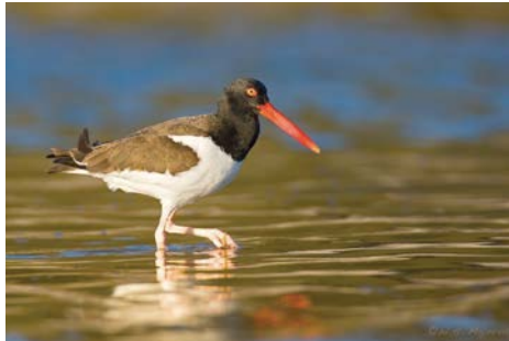
Sandy Point Island provides important habitat for the American Oystercatchers

the New England coast. Increased development and recreational use of the remaining barrier beach and island habitat have contributed toward the decline of shorebird populations. Some species, such as the roseate tern and piping plover, have dwindled to dangerously low numbers.